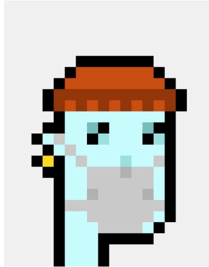
CryptoPunk #7523, 2017 Sold to SillyTuna, $11.7 million, Sotheby's