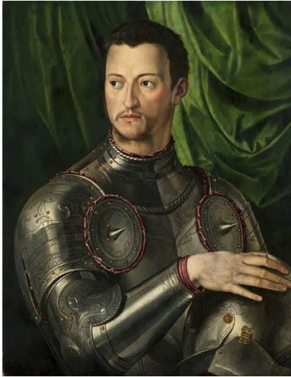
Cosimo I de Medici in Armour, 1545 Sold to The Met, price undisclosed